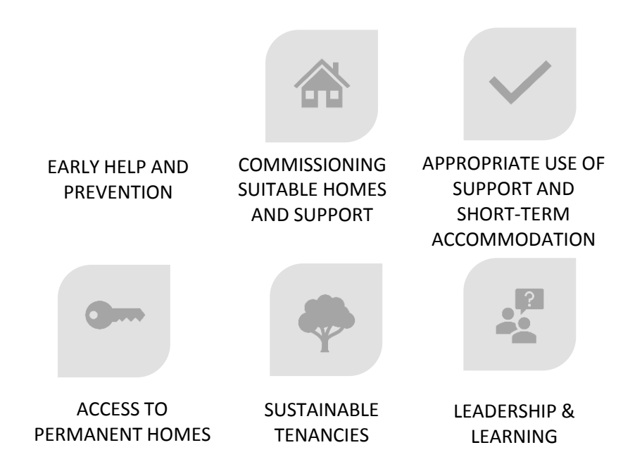
Figure 1: BF programme - key components

The key components of the BF programme are shown below, and illustrate a solution that starts with early help and prevention, before moving to considering how we are to commission services, before then ensuring that clients are placed in the correct accommodation with appropriate supports. We then must consider access to more stable accommodation, and then understand how we can work with customers and landlords to deliver sustainable tenancies. All the while, we must continue to learn and provide leadership. All of these components can be developed simultaneously within an overall project framework.